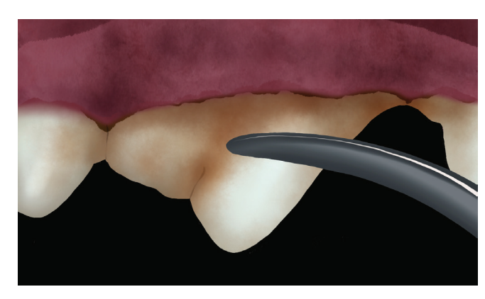
Placement of the ultrasonic scaler tip against the crown before activation.