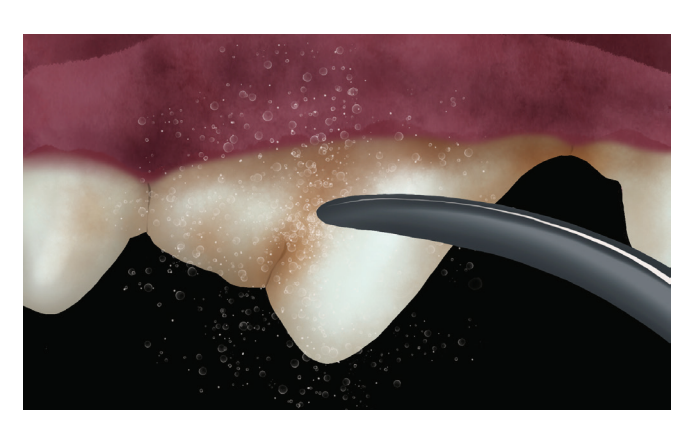
Activation and tuning of the ultrasonic scaler to deliver a cooling and irrigation mist.