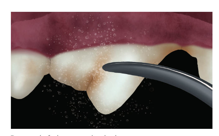
Removal of plaque and calculus.